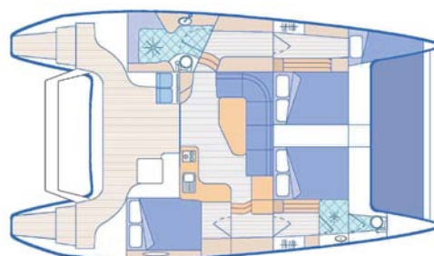
Galley Up; Aft Master Cabin; Fwd Ensuite with Shower; Rear Targa; Raised Transom seat