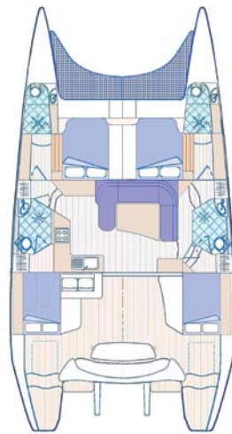
GALLEY UP LAYOUT 4 Queen cabins and 4 bathrooms.