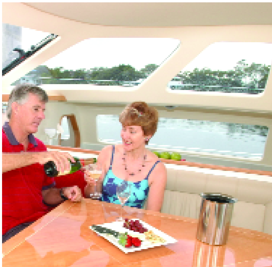
Intoxicating Comfort - The expansive saloon offers 360 degree views and unimpeded communication from the galley, cockpit and helm. (above)