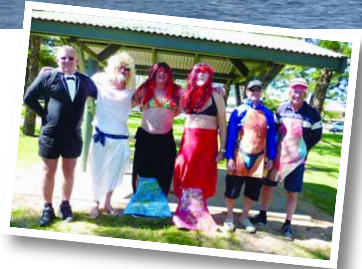
Mr Figurehead entrants battle it out. (above) Annual Cup LW45 Category Winner Gemini Lady . (below left) Lightwave's latest launch – LW45G Double Shot puts in two reefs as a 38kt blow goes over the deck. (below centre) Annual Cup LW38 Category Winner Bahama . (below right) Axis Mundi . (far left)

The next morning, if by magic, the storm clouds of the past few days rolled away and Saturday dawned bright and clear for the Finlease Champagne Breakfast, deliciously provided by Russell from caterers Spits 'N' Pieces, fruit kebabs, pastries and well ... champagne.