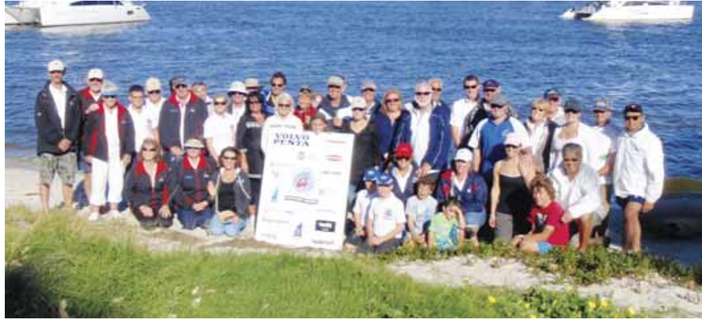
LW Regatta participants thank the Event Sponsors.